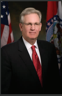
Jeremiah "Jay" Nixon Governor