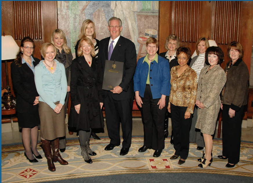
Governor Jay Nixon presents a proclamation to the Missouri Women's Council for Women's History Month